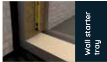
Wall starter tray

Calcium silicate, A fire-rated, waterproof and BBA approved.